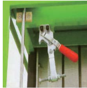
Fixture for Platform Guardrail