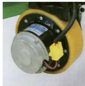
Drive Wheel (Optional)