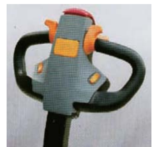
Motorized Drive (Optional)