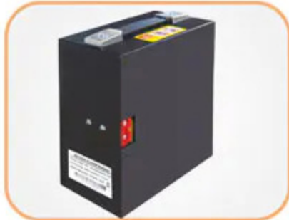
Lithium battery pack ★ (48V 10Ah/48V 15Ah)