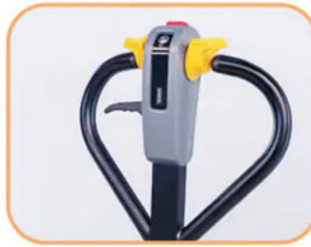
Multi-function Ergonomic Handle (Semi-electric)