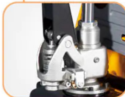
★ Manual Lifting/Lowering(Quick Lift)