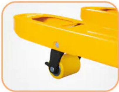
★ Tandem/Single PU wheel