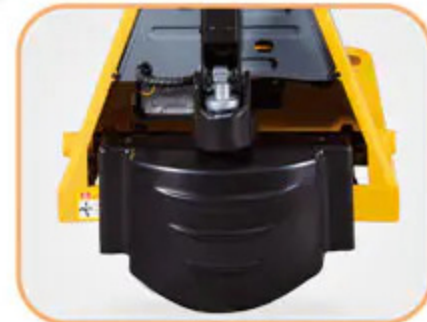
★ Protection cover