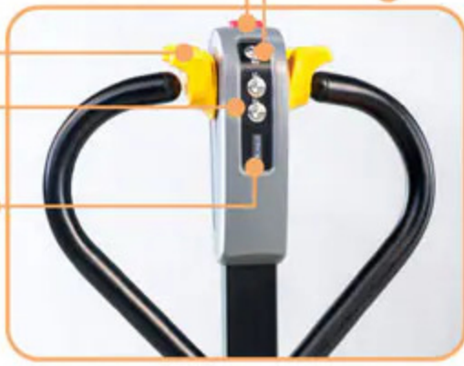
Multi-function Handle (Full Electric)