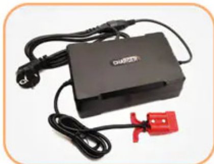
★ Fast Charger option(1.6/2.5hrs) (1.6 hrs for 10Ah battery / 2.5 hrs for 15Ah battery)