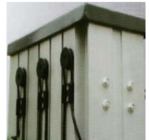
Aesthetic Wire Routing