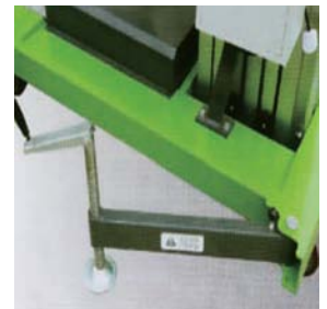
Screw type outriggers