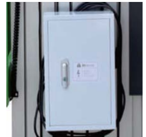
Ground Control Panel