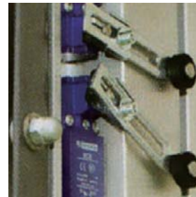
Double Limit Switch