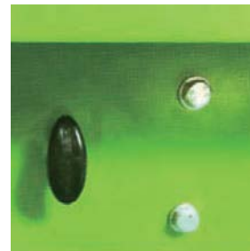
Emergency Descend Valve