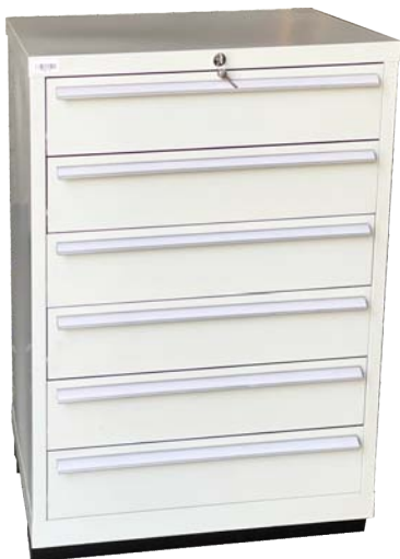
Heavy Duty Customizable Tools Trolley