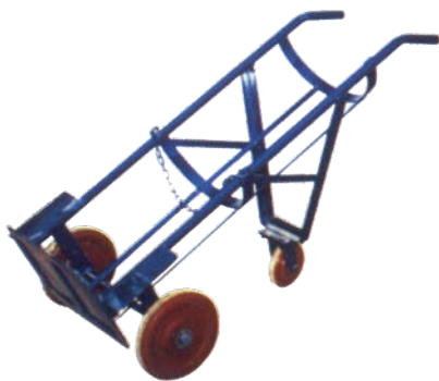
FIPL 215 Single Cylinder Trolley Size: 58(L) x 15 (w) x 12 (H) Inch