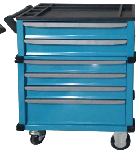
6 Drawer Tools Trolley