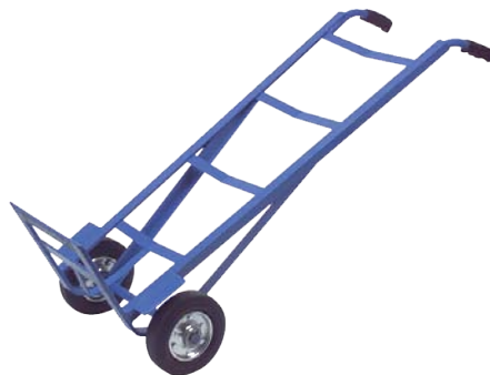
FIPL 213 Sack truck Cap: 500 kgs Size: 44(L) x 20(W) x 12(H) Inch