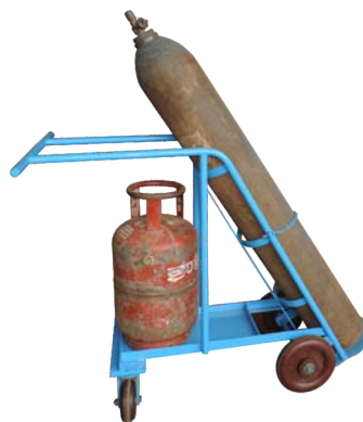
FIPL 216 Double Cylinder Trolley Size: 30(L) x 18(W) x 12(H) Inch Oxygen-LPG