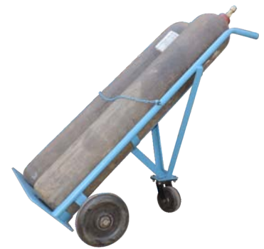
FIPL 214 Double Gas Cylinder Trolley Oxygen and Nitrogen