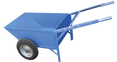
FIPL 211 Double Wheel Barrow with scooter wheel Cap: 6 cut ft Size: 34(L) x 24(W) x 12(H) Inch