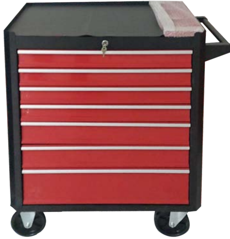
7 Drawer Tools Trolley