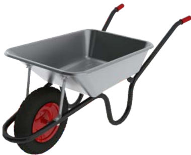
FIPL 212 Single Wheel Barrow Cap: 6 cut.ft Size: 36(L) x 24(W) x 12(H) inch