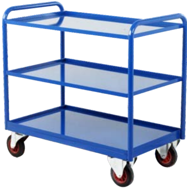
FIPL 209 Tray Trolley P.S: 900 x 600 mm Cap: 500 kgs