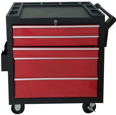
5 Drawer Tools Trolley