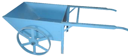
FIPL 210 Metal Wheel Barrow Cap: 6 cut ft Size: 34(L) x 24(W) x 12(H) Inch